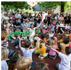
The practice of To-Gather in Slovenia